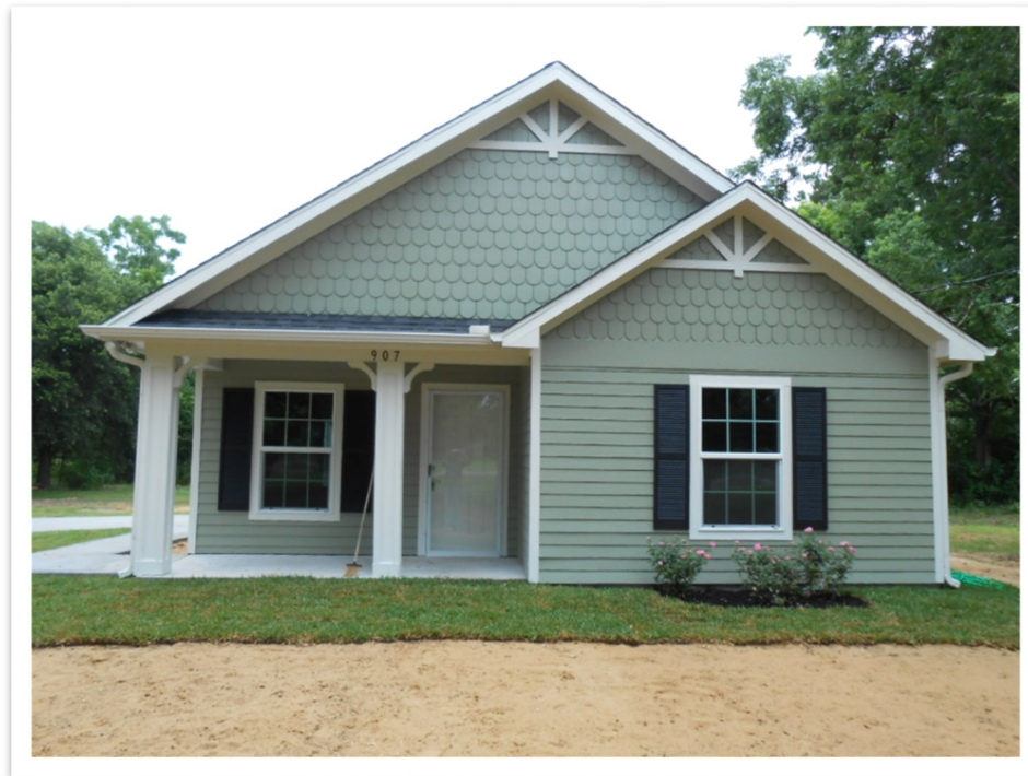
Home completed in July 2013 with a build out time of 31 days!

Due to DSW Homes' success in the Chambers County Disaster Recovery Round 1.1, we were awarded over 9 million dollars to participate in Round 1.2, with the ability to reconstruct or rehabilitate 75 homes. As part of Round 1.2, DSW Homes is pairing up with the Houston-Galveston Area Council to help Chambers County residents apply and become qualified to participate in the program, acting as both the prime contractor and the building contractor. In this round, DSW Homes has already completed the reconstruction of 16 homes, with 11 more under construction or soon to be under construction.