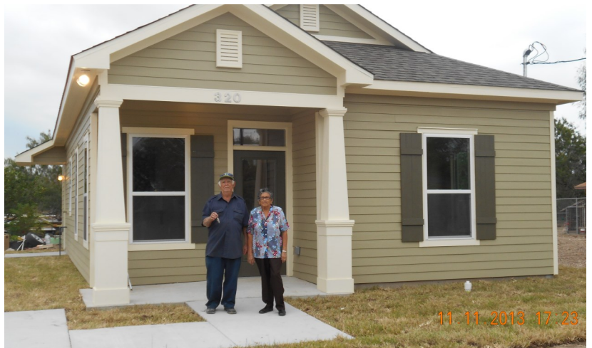
After photo of home in Hidalgo County, completed by DSW Homes in November 2013