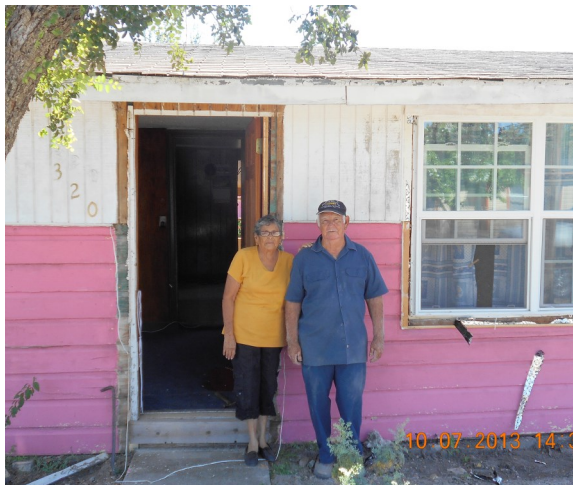
Before photo of home in Hidalgo County