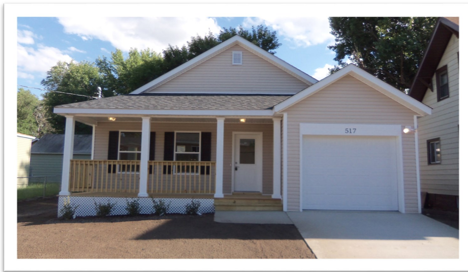
A newly reconstructed home in Minot, ND. Finished in July 2013 by DSW Homes.