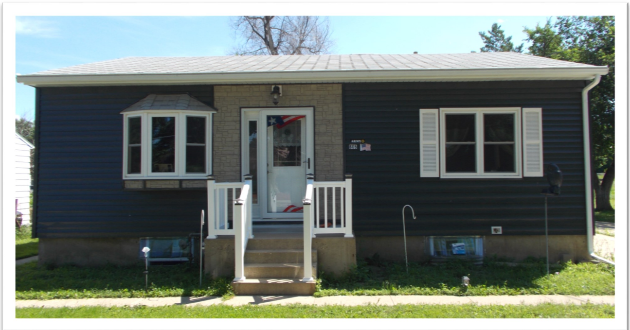
A home rehabilitated by DSW Homes in Minot, ND.