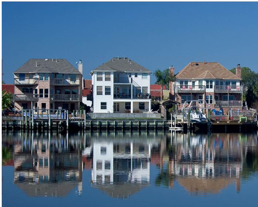
Homes located in Nassau Bay, Harris County